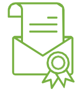
Permit & Subsidy